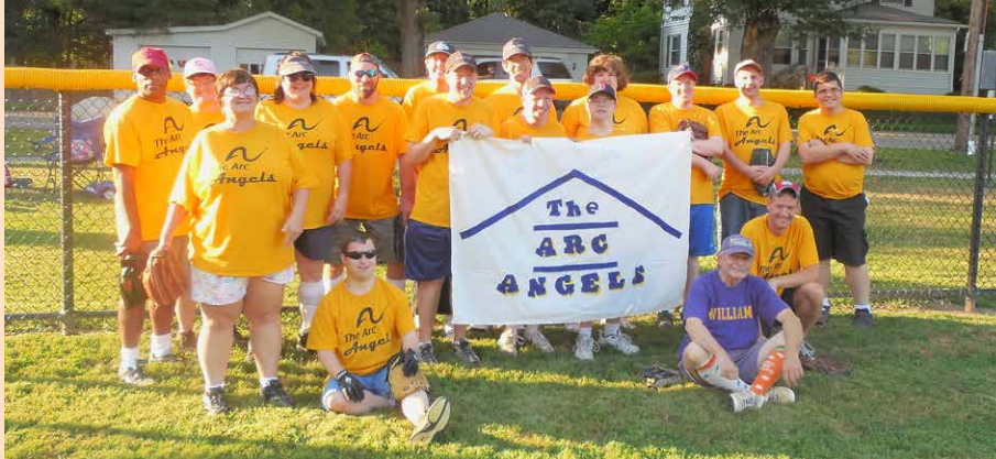
The 2014 Arc Angels Softball Team

to give him an ice bucket shower, for a donation to The Arc. $100 was raised. Thanks Troy for taking one for the team!