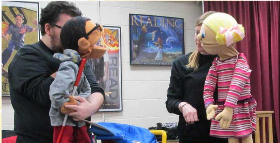
Kids on The Block presented a program on Braille at the Somerset Public Library this winter. For more information about Kids on The Block, please go to our website www.arcnbc.org or call (508) 679-0001.